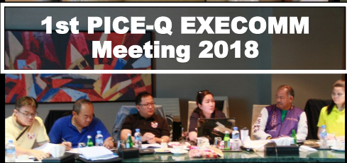
1st PICE-Q EXECOMM Meeting 2018