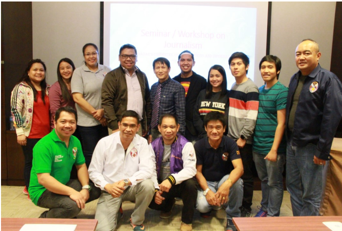
In this File Photo: COPI Editorial Staffs attended the Workshop on Journalism

The Committee on Publication and Information (COPI) conducted a Journalism workshop on Friday, January 26, 2018 at the Oryx - Rotana Hotel, Doha, State of Qatar.