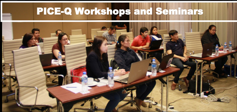
PICE-Q Workshops and Seminars