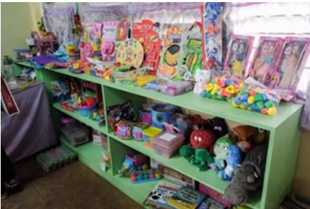
The toys donated for kindergarten students of Dulong Bayan Elementary School, San Mateo, Rizal, Philippines