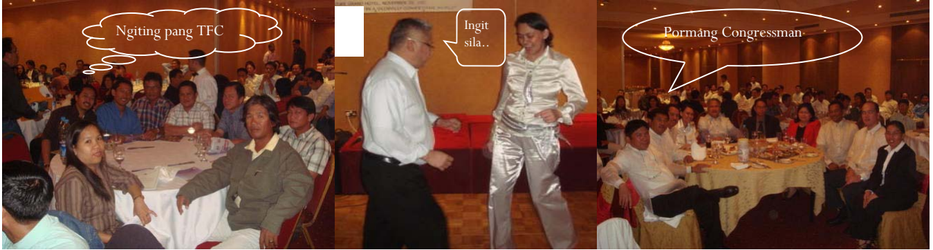
YEAR END PARTY AND INDUCTION CEREMONY (NOVEMBER 29, 2007)