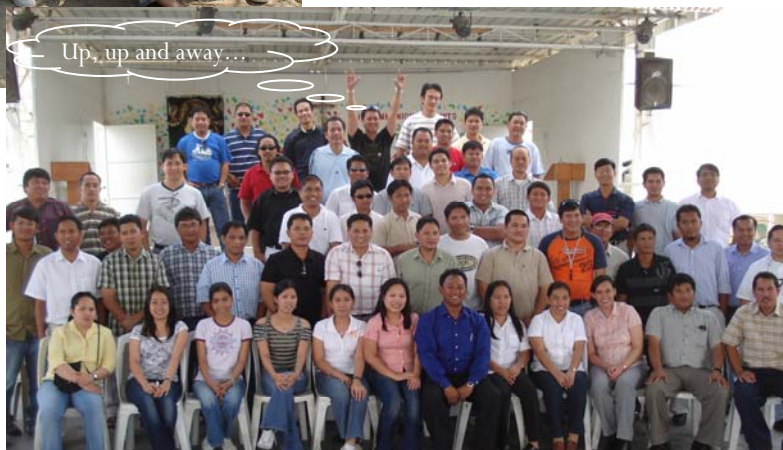
PLANNING SEMINAR (NOVEMBER 02, 2007)