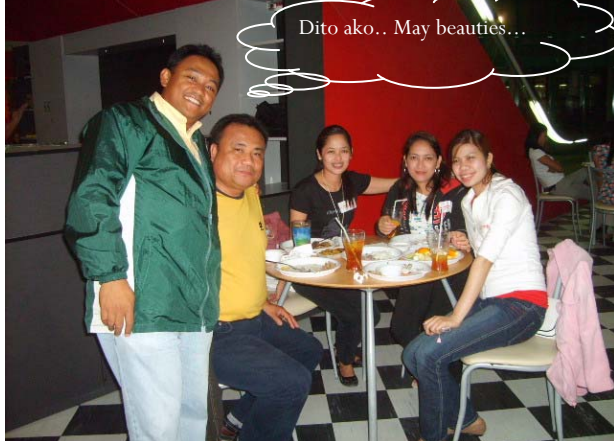
PICE-QATAR CHRISTMAS PARTY (DECEMBER 19, 2007)