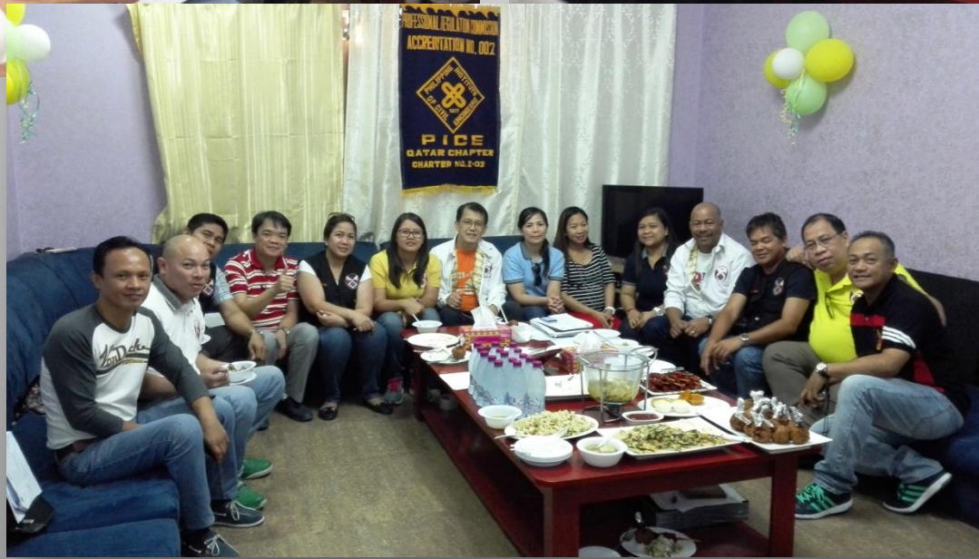
7 th - BOARD OF DIRECTORS' MEETING Venue: Filipino Cultural Center, Doha, Qatar