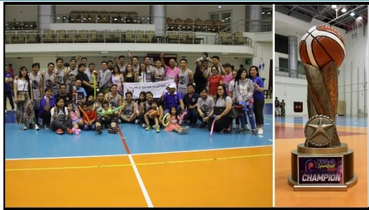
PICE Qatar "Builders" is the Champion of the 2019 PPO Qatar Basketball Tournament with an 11-0 record breaking standing