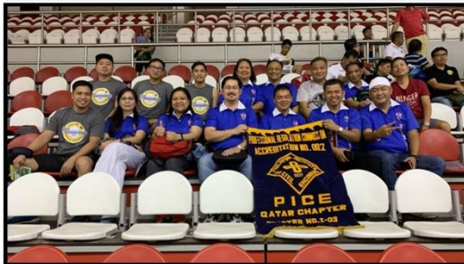
June 14, 2019—121st Philippine Independence Day Celebration at Al Arabi Sports Club

On June 14, 2019, the PICE Qatar Chapter joins the 121st Philippine Independence Day held at Al Arabi Sports Club with other Filipino professional organizations and several civic groups.