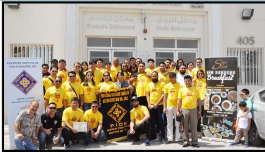
PICE Qatar Members and Spice & Sizzle for the Blood Donation Campaign 2019