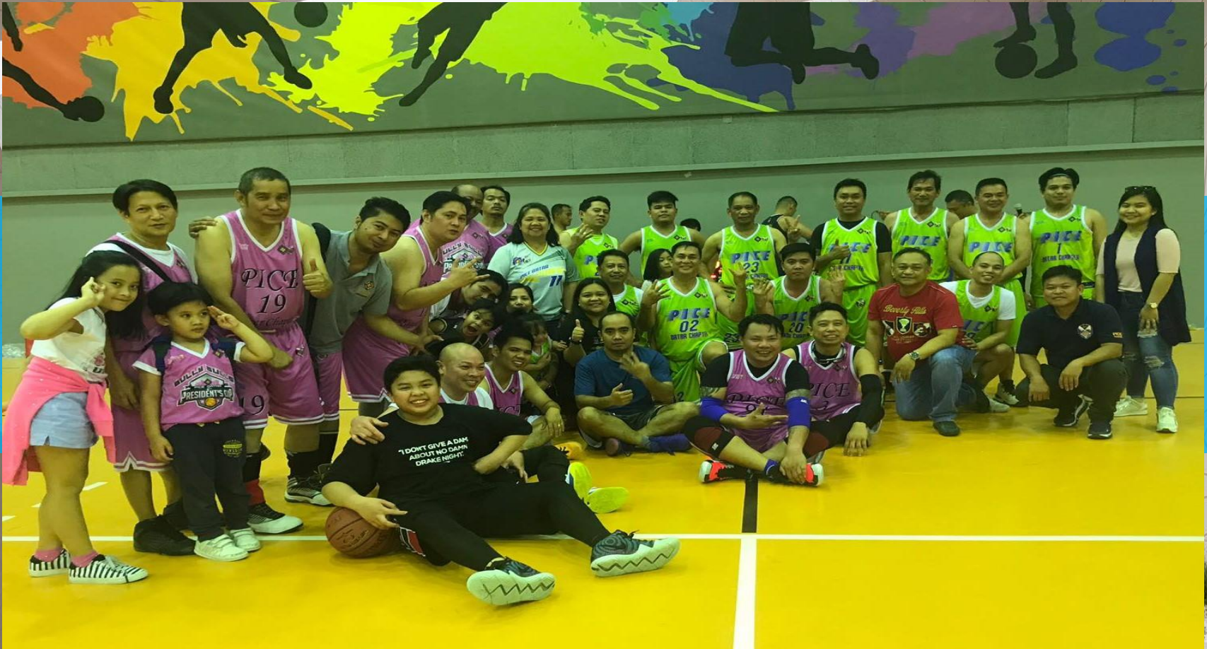
6 th PRESIDENT'S CUP 2019 PICE QATAR MEMBERS & FAMILY Al Arab Academy Gymnasium