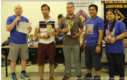
White Team emerge victorious on the 2019 PICE Qatar ICBL.

The PICE Qatar Inter-Color Basketball League (ICBL) 2019 Semifinal started on May 3, 2019, at the Main Court of the Aspire Ladies Hall. The opening game will be between the second-seeded Gray teams and the third-seeded White team with the former enjoying a twice-to-beat advantage.